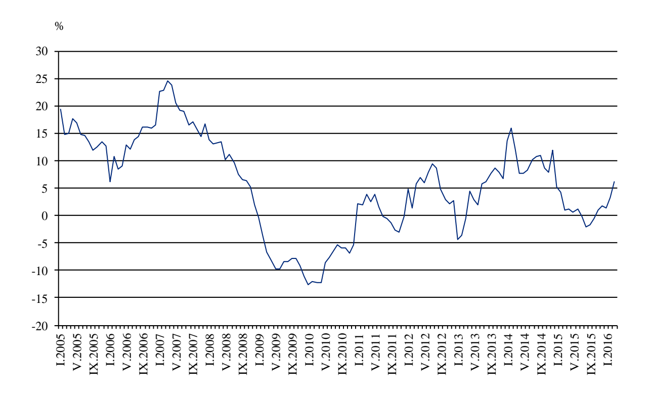
Figure 3. Change of turnover in 'Retail trade, except of motor vehicles and motorcycles' compared to the same month of the previous year (Working day adjusted)

In March 2016 compared to the same month of 2015 the turnover increased more significantly in the 'Retail sale of textiles, clothing, footwear and leather goods' by 20.1%, in the 'Retail sale of food, beverages and tobacco' by 13.0%, in the 'Retail sale of automotive fuel' by 10.5% and in the 'Dispensing chemist; retail sale of medical and orthopaedic goods, cosmetic and toilet articles' by 6.0%. A decrease was registered in the 'Retail sale of computers, peripheral units and software; telecommunications equipment' - 13.7%, in the 'Retail sale in non-specialised stores' - 5.5%, in the 'Retail sale via mail order houses or via Internet'-