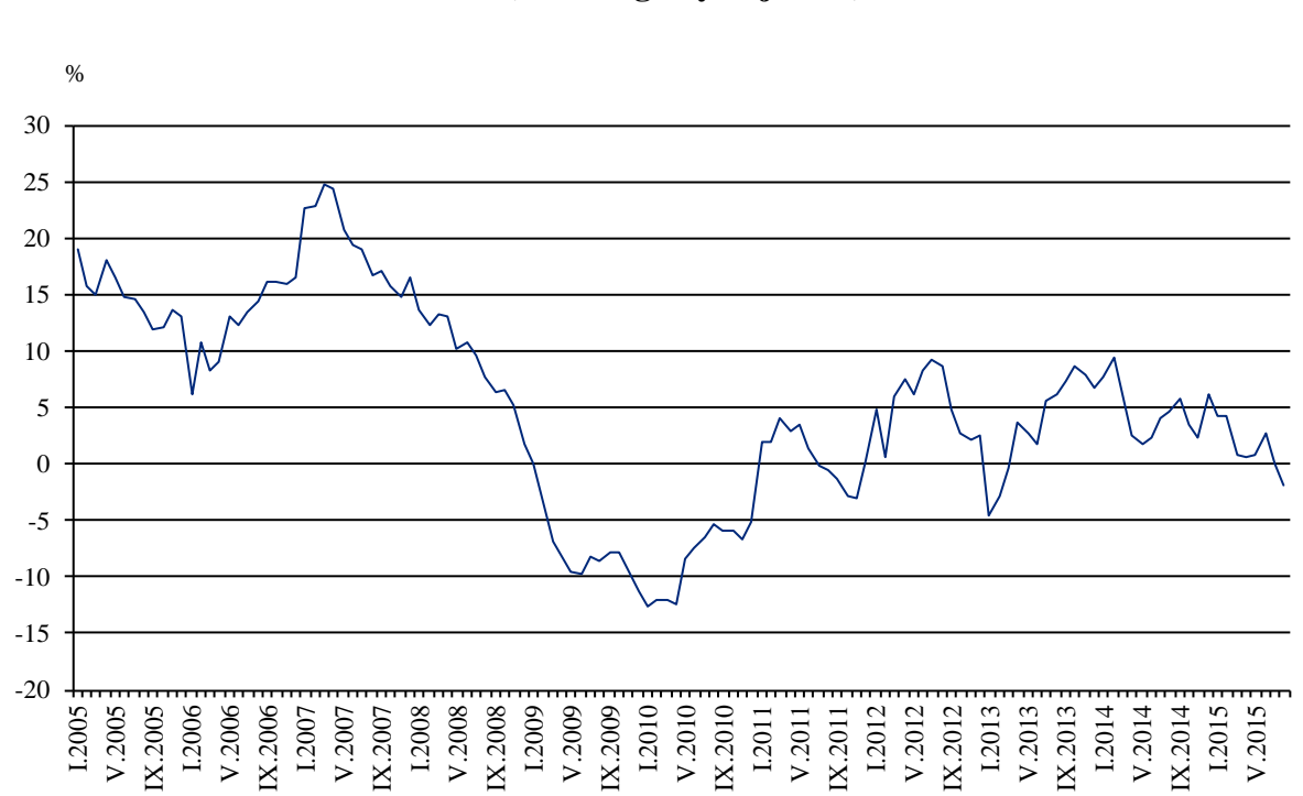
Figure 3. Change of turnover in 'Retail trade, except of motor vehicles and motorcycles' compared to the same month of the previous year (Working day adjusted)

In August 2015 compared to the same month of 2014 the turnover increased more significantly in the 'Retail sale via mail order houses or via Internet' by 15.2%, in the 'Dispensing chemist; retail sale of medical and orthopaedic goods, cosmetic and toilet articles' by 13.3% and in the 'Retail sale in non-specialised stores' by 7.5% and in the 'Retail sale of audio and video equipment; hardware, paints and glass; electrical household appliances' by 6.6%. A drop was registered in the 'Retail sale of automotive fuel' and in the 'Retail sale of textiles, clothing, footwear and leather goods' - 8.9%, in the 'Retail sale of food, beverages and tobacco' - 5.3% and in the 'Retail sale of computers, peripheral units and software; telecommunications equipment' - 1.8%.