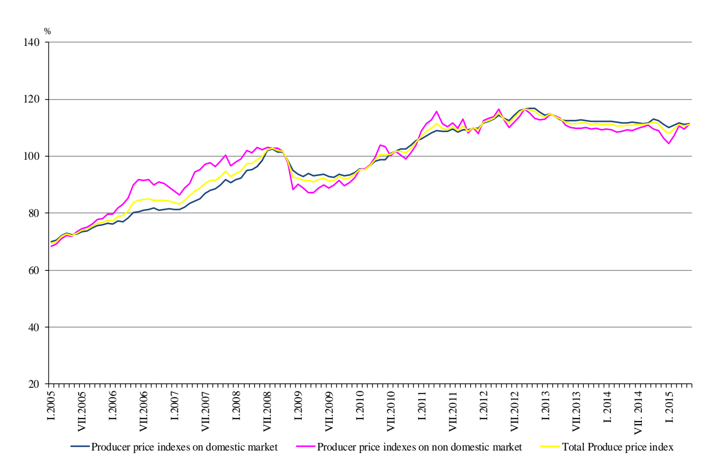
Figure 2. Total Producer Price Indices in Industry (2010 = 100)

In the manufacturing, the prices fell by 0.7% compared to May 2014. More significant prices decreases were seen in the manufacture of other non-metallic mineral products by 1.2% and in the manufacture of food products by 0.9%, while the producer prices went up in the manufacture of basic metals by 11.7%, in the manufacture of other transport equipment by 8.3%, and in the manufacture of textiles by 5.9%.