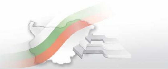
Hourly labour cost index for the period third quarter of 2008 third quarter of 2010 (Working day adjusted)